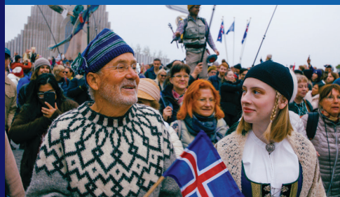
JOSEPH ROSENDO'S STEPPIN' OUT THU Sep 18 | 5:30 PM CREATE