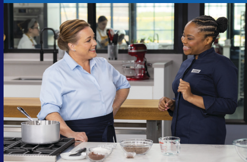
AMERICA'S TEST KITCHEN – NEW SEASON SAT Sep 20 | 12 PM NHPBS