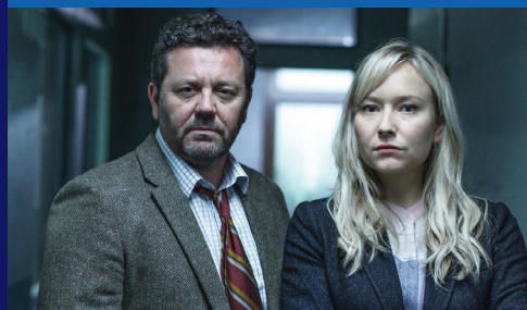
THE BROKENWOOD MYSTERIES THU Sep 11 | 10 PM EXPLORE