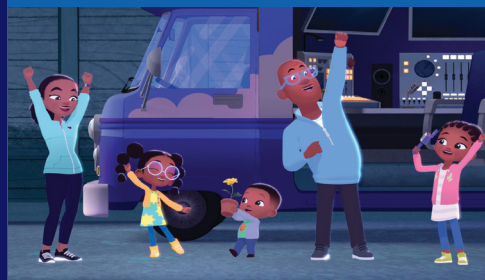
WEATHER HUNTERS MON Sep 8 | 4:30 PM NHPBS KIDS