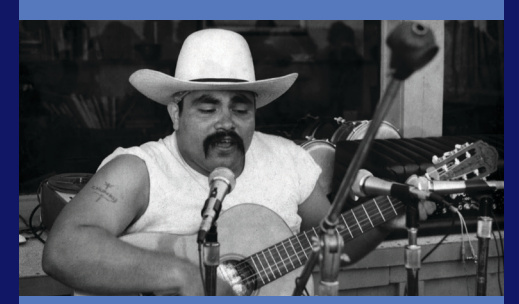
Singing Our Way to Freedom THU Sep 22 | 9 PM NHPBS