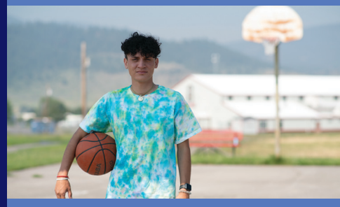
Facing Suicide TUE Sep 13 | 9 PM NHPBS