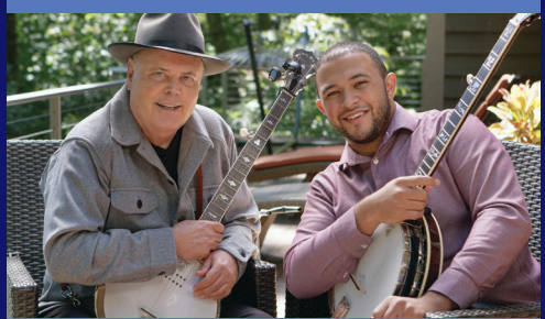
David Holt's State of Music MON Sep 5 | 3 PM NHPBS EXPLORE

Variety Studio: Actors on Actors SUN Sep 4 [6:30 PM NHPBS