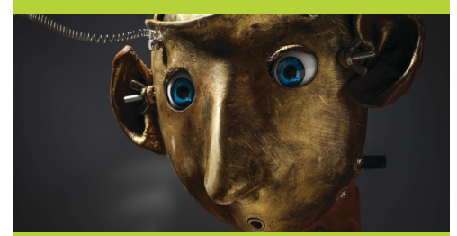
POV: OUR TIME MACHINE MON September 28 | 10 PM NHPBS