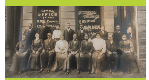
BOSS: THE BLACK EXPERIENCE THU September 24 | 9 PM NHPBS