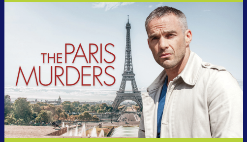
THE PARIS MURDERS STREAM ANYTIME ON NHPBS PASSPORT