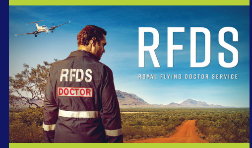
ROYAL FLYING DOCTOR SERVICE SEASON 2 STREAM ON NHPBS PASSPORT 11/23