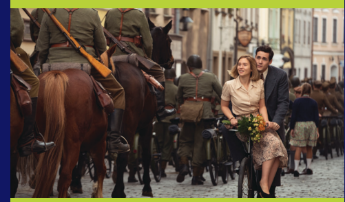
WORLD ON FIRE STREAM ANYTIME ON NHPBS PASSPORT