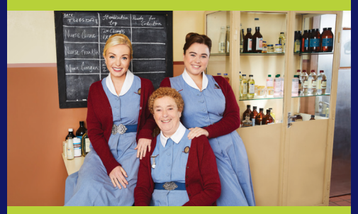
CALL THE MIDWIFE HOLIDAY SPECIALS STREAM ON NHPBS PASSPORT 11/25