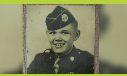
GRANDPA'S WAR STORY GOES VIRAL THU November 12 | 8 PM NHPBS