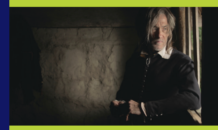
PILGRIMS: AMERICAN EXPERIENCE THU November 26 | 9 PM NHPBS

ON-AIR | MOBILE | ONLINE | CLASSROOMS | COMMUNITY