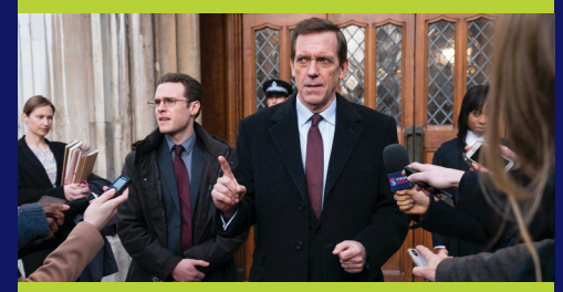
ROADKILL ON MASTERPIECE SUN November 1 | 9 PM NHPBS