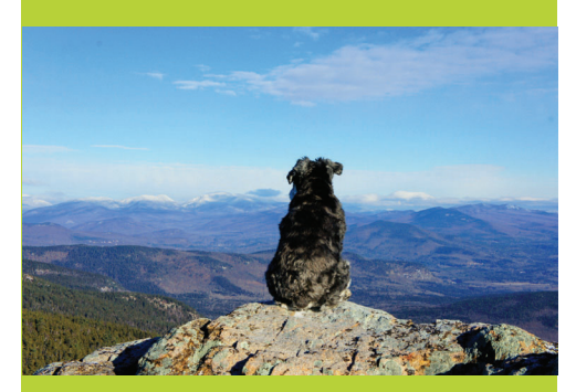
Windows to the Wild: Atticus WED November 21 | 7:30 PM