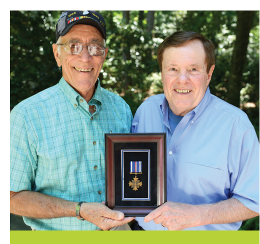
We'll Meet Again TUE November 13 | 8 PM

Meet the first woman judge to be appointed to the Middle East's Shari'a (Islamic law) courts. "The Judge" presents an unfolding legal drama with rare insight into both Islamic law and gendered justice.