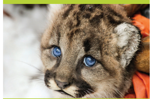
Nature: Super Cats WED November 7 | 8 PM