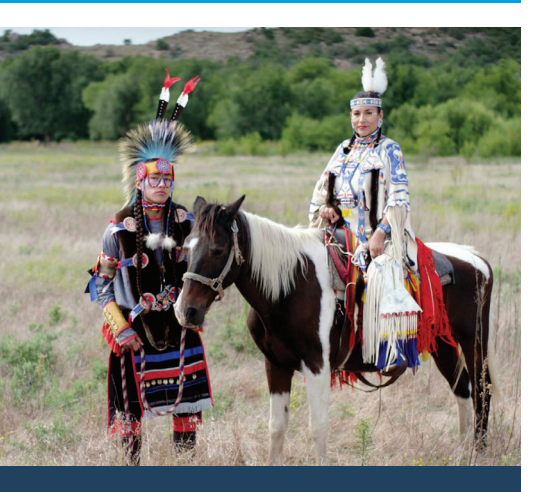
Native America TUE November 13 | 9 & 10 PM

See how a group of Native and non-Native leaders in Maine came together to acknowledge and address the abuses suffered by Native American children in the hands of the child welfare system.