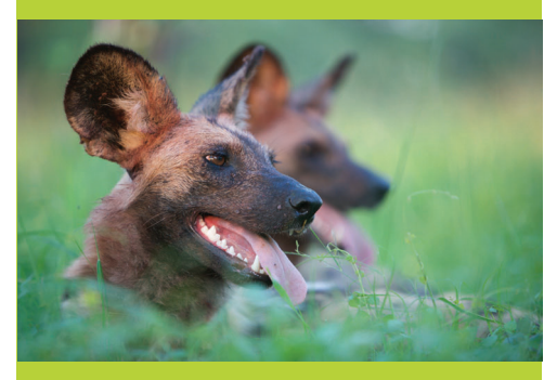
Nature: Dogs in the Land of Lion WED November 21 | 8 PM

ON-AIR | MOBILE | ONLINE | CLASSROOMS | COMMUNITY