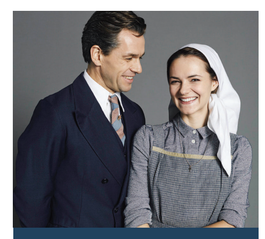
Great Performances: Sound of Music FRI November 9 | 9 PM

Explore the world created by America's First Peoples 15,000 years ago. Combining modern science with Native knowledge, the series shines a spotlight on these ancient cultures and the communities that still thrive today.