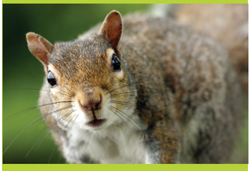
Nature: Squirrel's Guide to Success WED November 14 | 8 PM