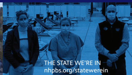
THE STATE WE'RE IN nhpbs.org/statewerin