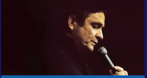
JOHNNY CASH: THE MAN IN BLACK THU Feb 6| 9:30 PM NHPBS