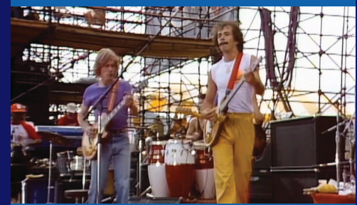
SANTANA LIVE AT THE US FESTIVAL MON Feb 10 | 10 PM NHPBS