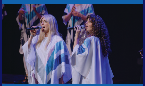
ARRIVAL FROM SWEDEN: MUSIC OF ABBA THU Feb 27 | 9:30 PM NHPBS