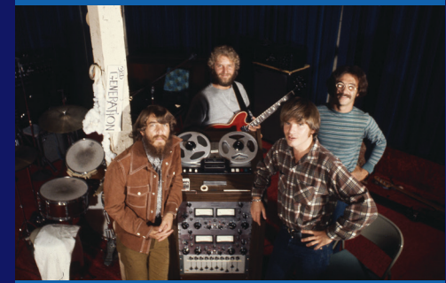
CREEDENCE CLEARWATER REVIVAL MON Feb 3 | 10 PM NHPBS