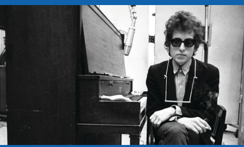
BOB DYLAN IN NEWPORT MON Feb 17 | 10 PM NHPBS