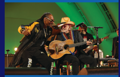
WILLIE NELSON'S 90TH BIRTHDAY CELEBRATION MON Dec 2 | 7:30 PM NHPBS