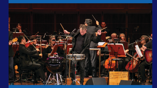
VIOLENT FEMMES 40TH ANNIVERSARY FRI Dec 13 | 9 PM NHPBS