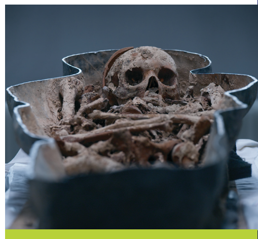
NOVA: Lost Tombs of Notre Dame WED Dec 18 | 9 PM NHPBS

It's Christmas 1969, and the funfair and carol concert add color to frosty Poplar, yet, the festive spirit at Nonnatus House is dampened by the spread of influenza alongside growing fears of an escaped prisoner after a spate of break-ins.