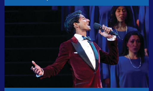
JOY – CHRISTMAS WITH THE TABERNACLE CHOIR TUE Dec 17 | 8 PM NHPBS