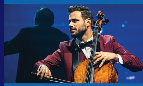
HAUSER: CLASSICAL GALA CONCERT FRI Dec 6 | 9 PM NHPBS