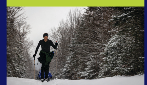
WINDOWS TO THE WILD: CHANGING WINTER WED Apr 12 | 7:30 PM NHPBS