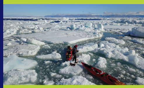
BENEATH THE POLAR SUN SUN Apr 9 | 9 PM NHPBS EXPLORE