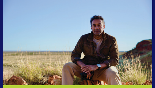
CHANGING PLANET: SEASON 2 WED Apr 19 | 9 PM NHPBS