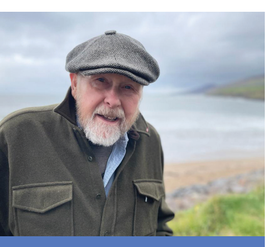
Windows to the Wild: Journey Across Ireland WED Apr 5 | 7:30 PM NHPBS