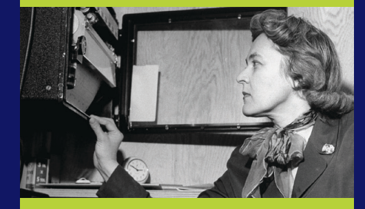
AMERICAN EXPERIENCE: THE SUN QUEEN TUE Apr 4 | 9 PM NHPBS