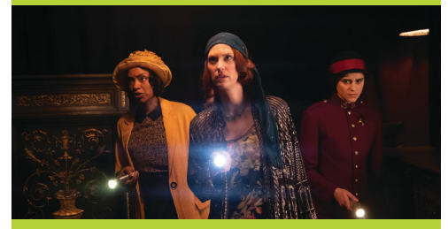
FRANKIE DRAKE MYSTERIES THU April 23 | 9 PM NHPBS EXPLORE