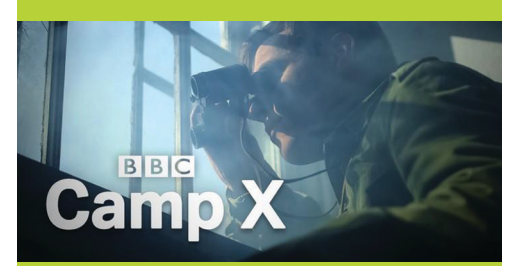
CAMP X THU April 9 | 9 PM NHPBS EXPLORE